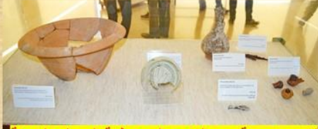
لقى متنوّعة من الفترة البيزنطية إلى المملوكية

عرض لبعض اللقى الأثرية من سيّدة الريح في التنقيب عام 2012 والتي عرضت في معرض آثار أنفه في جامعة البلمند عام 2015