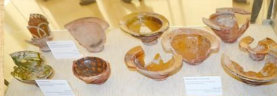
آنية فخارية ما بين القرن 12 والقرن 16 م.