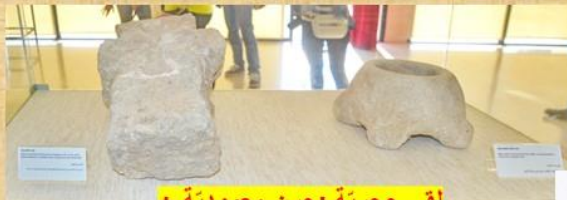
لقى حجرية: جرن معمودية + جرن للماء المقدس وصليب منحوت