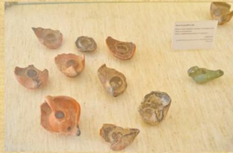
سرج زيتية ما بين القرن 11 و14م