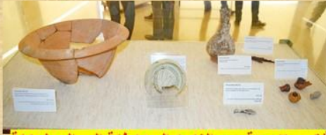
لقى متنوّعة من الفترة البيزنطية إلى المملوكية

عرض لبعض اللقى الأثرية من سيّدة الريح في التنقيب عام 2012 والتي عرضت في معرض آثار أنفه في جامعة البلمند عام 2015