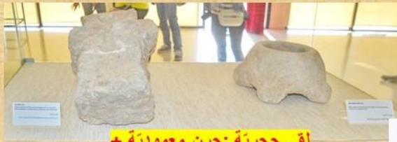
لقى حجرية: جرن معمودية + جرن للماء المقدّس وصليب منحوت