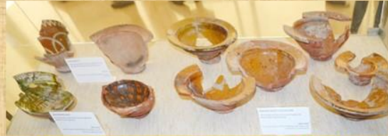
أنية فخارية ما بين القرن 12 والقرن 16 م.